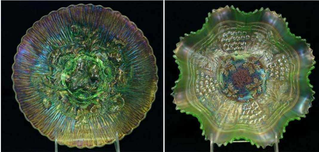
Left: Poppy Show 9" plate. Right: Stippled Grape & Cable ruffled bowl w/ribbed back.

The history of pastel values in carnival glass is a mini-story in itself. In the early period of carnival glass collecting, pastels weren't see as desirable by many collectors. That all changed, of course, with pastels becoming some of the most valuable pieces in many collections. "I bought these because I thought they were beautiful," says Joyce. Though known throughout carnival glass as being a collector of impeccable color, Joyce has also added several very rare pieces to her collection. "Having put together and selling a collection before, I have experienced collecting a wide variety of value and rarity," explains Joyce. "The second time around is more fun because you can fall in love with the glass again."