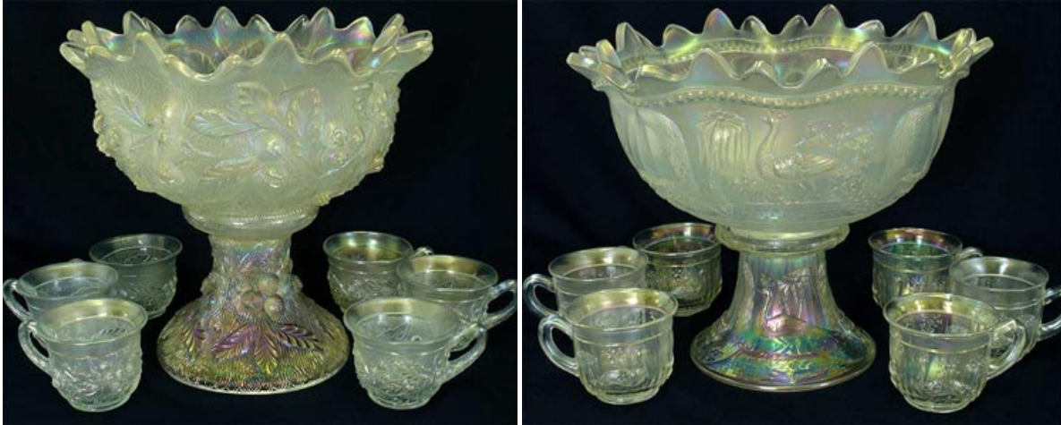
Left: Acorn Burrs 8 pc. punch set. Peacock at the Fountain 8 pc. punch set.

Punch sets in white are always a rare and exquisite find to add to any carnival glass collection, and the two examples above really bring the color. "I love these punch sets," says Joyce. "The cups match the bowl and base in each set very well, and they really do show great color on white."