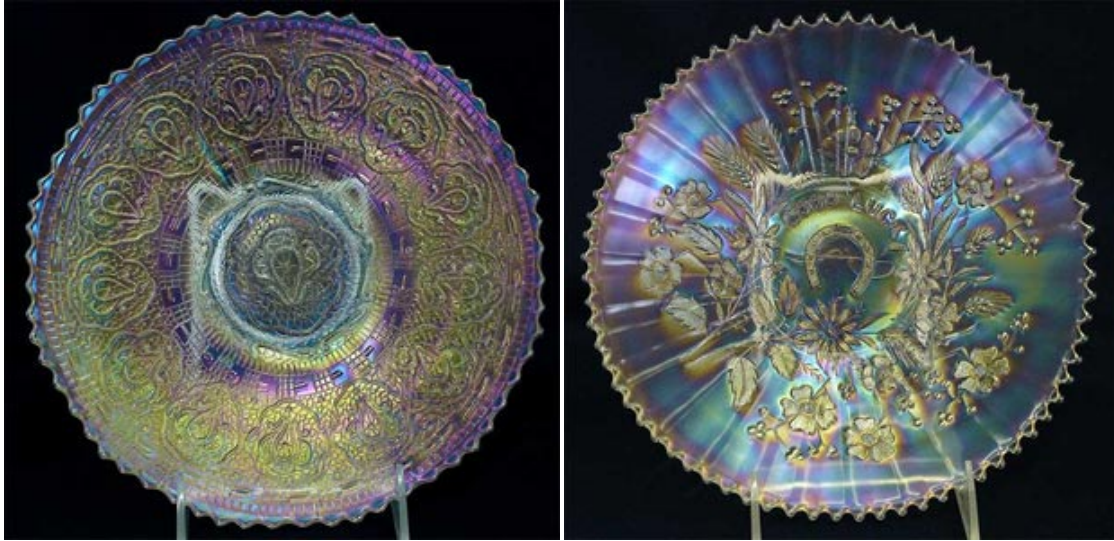
Left: Persian Medallion 9" plate. Good Luck 9" plate w/ribbed back.

The examples of white above illustrate the power of iridescence on white carnival glass. The Persian Medallion plate has brilliant blues and purples in its iridescence that leads some to believe the plate is Ice Blue until they inspect the base. The Good Luck plate adds greens and yellows to the blues, pinks and purples to give an even broader spectrum of colors to the palette.