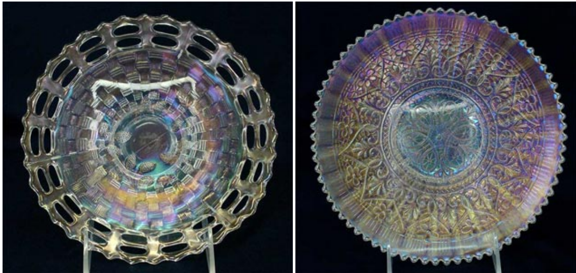
Left: Blackberry Open Edge plate. Hearts & Flowers 9" plate.

The examples of white above illustrate the power of iridescence on white carnival glass. The Persian Medallion plate has brilliant blues and purples in its iridescence that leads some to believe the plate is Ice Blue until they inspect the base. The Good Luck plate adds greens and yellows to the blues, pinks and purples to give an even broader spectrum of colors to the palette.